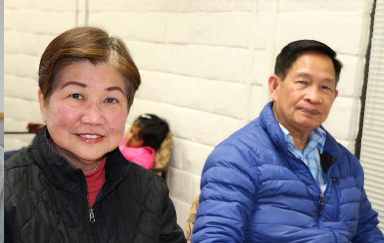
IIBA's Fremont Citizenship Workshop